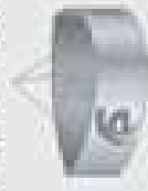
Three-Sided Curve (O2)